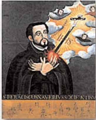
17th-century Japanese portrait of Francis Xavier, the Spanish Jesuit who introduced Christianity to Japan in the mid-16th century

All this came to an abrupt end in 1639, when the ruling warrior government enforced a strict "closed country" (sakoku) policy: Japanese were forbidden to travel abroad, foreigners were expelled, and Christian worship was forbidden and cruelly punished.