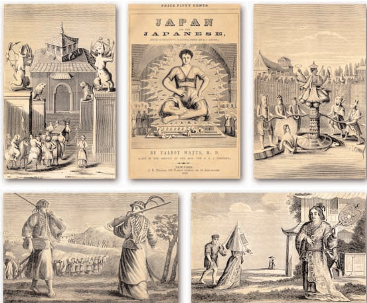
Illustrations in Japan and the Japanese (1852) included the worshipping of idols, “Habit of the Japanese Soldiers,” and “A Japanese Lady of Quality”

In Japan and the Japanese , a small book published in America in 1852 as a send-off to the Perry expedition, a former employee of the British East India Company paired synopses of prior writings with a selection of illustrations that revealed how odd and exotic the little-known heathen still remained in the imagination of Westerners. These thoroughly fanciful graphics conjured up a world of bizarre religious icons commingled with sturdy men and women wearing Chinese-style robes, holding large and stiff fan-shaped implements, even promenading with folded umbrella-like tents draped over their heads and carried from behind by an attendant.