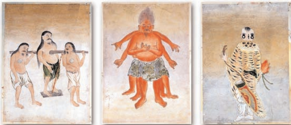
"People of Forty-two Lands" (details), ca. 1720

An 18th-century scroll titled "People of Forty-two Lands," for example, played to such imagination with illustrations of figures with multiple arms and legs, people with huge holes running through their upper bodies, semi-human creatures feathered head to toe like birds, and so on.