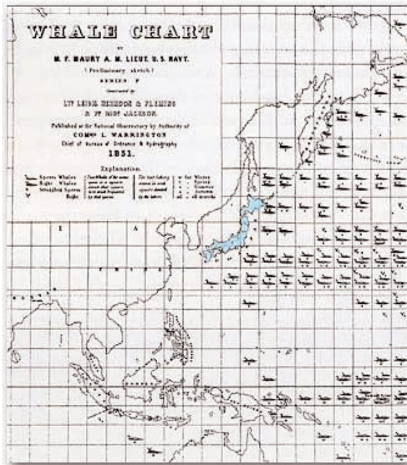
Whale Chart, Japan in blue (detail, color added) by M.F. Maury, US Navy, 1851