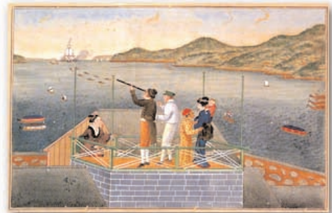
The "fan-shaped" island of Dejima in Nagasaki harbor, where the Dutch were permitted to maintain an enclave during the period of seclusion