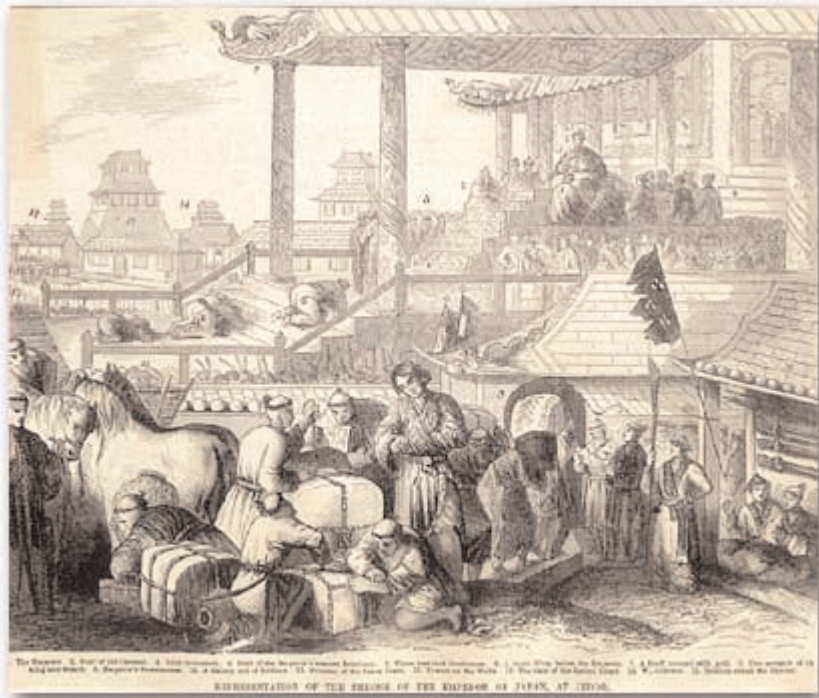
"Representation of the Throne of the Emperor of Japan, at Jeddo" from the April 12, 1853 issue of Gleason's Pictorial

Such fantasy masquerading as informed commentary and illustration was typical. Just months before Perry's arrival in Japan, the popular U.S. periodical Gleason's Pictorial Drawing-Room Companion published a dramatic engraving depicting "the emperor of Japan" holding public court in "Jeddo" (the old romanized spelling of Edo, the capital city later renamed Tokyo). Here, too—despite being annotated with 15 numbered details—the graphic was entirely imaginary. The emperor lived in Kyoto rather than Edo. His palace surroundings were not highly Sinified ("Chinese"), as depicted here. He never held public court. And Japanese "gentlemen" and "soldiers" did not wear costumes or sport hairstyles of the sort portrayed.