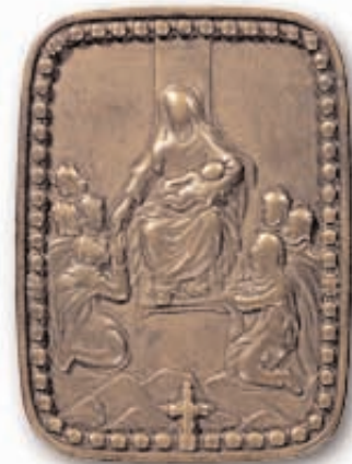
Fumie of Virgin Mary with Christ child

The rationale behind the draconian seclusion policy was both strategic and ideological. The foreign powers, not unreasonably, were seen as posing a potential military threat to Japan; and it was feared, again not unreasonably, that devotion to the Christian Lord might undermine absolute loyalty to the feudal lords who ruled the land.