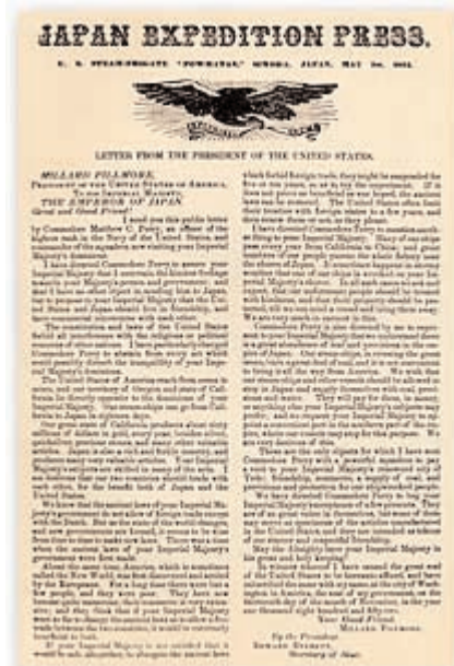
President Fillmore's 1853 letter to "The Emperor of Japan"

The message Perry brought to Japan's leaders from President Millard Fillmore also looked forward, in very general terms, to the eventual establishment of mutually beneficial trade relations. On the surface, Perry's demands seemed relatively modest. Yet, as his own career made clear, this was also a moment when the world stood on the cusp of phenomenal change.