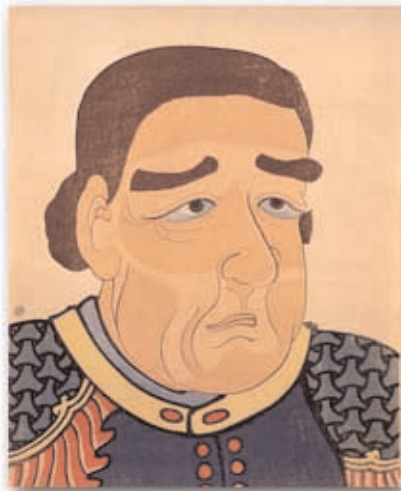
Perry, ca. 1854