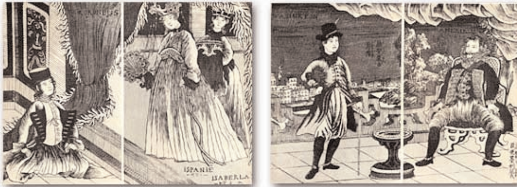
Illustrations from a Japanese book about the United States published on the eve of Perry's arrival included imaginary renderings of "Columbus and Queen Isabella" (left) and "George Washington and Amerigo Vespucci" (!)