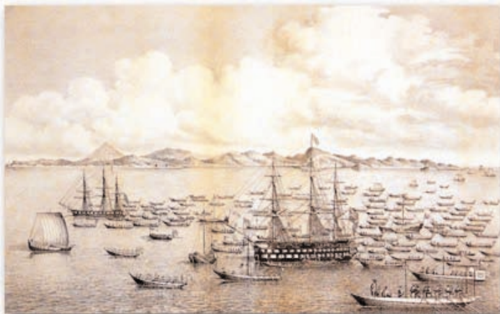
Lithograph depicting Commodore Biddle's ships anchored in Edo Bay in 1846 and surrounded by small Japanese boats

The following year, two warships commanded by Commodore James Biddle entered Edo Bay and engaged in preliminary contact with Japanese officials. Biddle was not allowed to come ashore, however, and when ordered to "depart immediately" did precisely as he had been told—leaving no legacy beyond a few American and Japanese illustrations of his warships.